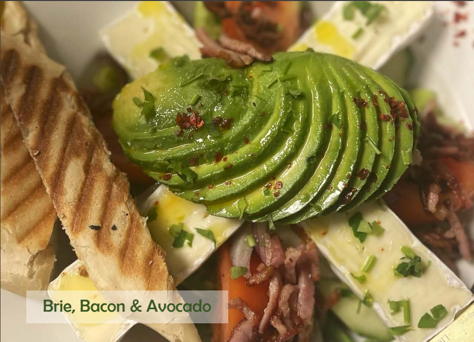
Brie, Bacon & Avocado