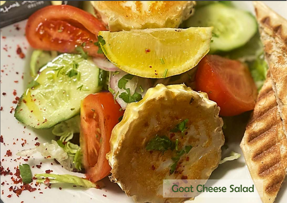
Goat Cheese Salad